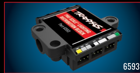
PRO SCALE LIGHTING DISTRIBUTION BLOCK