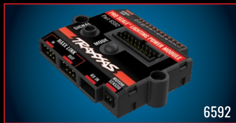
PRO SCALE LIGHTING POWER MODULE